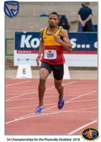
SA Championships for the Physically Disabled 2018