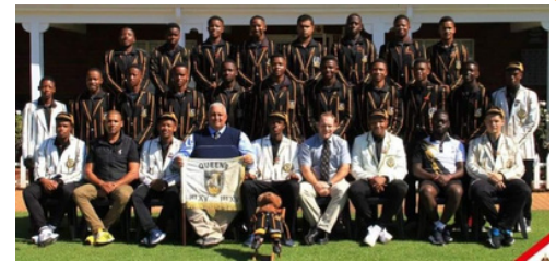
2023 Queen's College 1st Team Squad

The Queen's College 1st Rugby team had 7 players selected for the Border u18 side for the 2023 Craven Week Tournament, and 3 were selected for the Border u18 Academy team. They beat reputable district rivals Selborne College and Dale College in both home and away fixtures in 2023 and were unbeaten in the Border region in for the year.