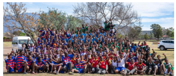
Schools u/13 Rugby Development Teams